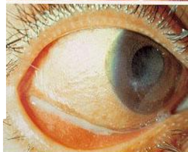
Plate 13 (right): Corneal and conjunctival xerosis