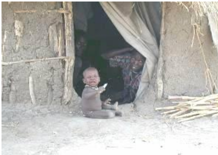
Plate 12 (above): Malnutrition in rural Sudan