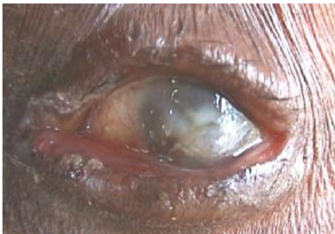
Plate 14 (left) Ocular microfilariais in onchocerciasis