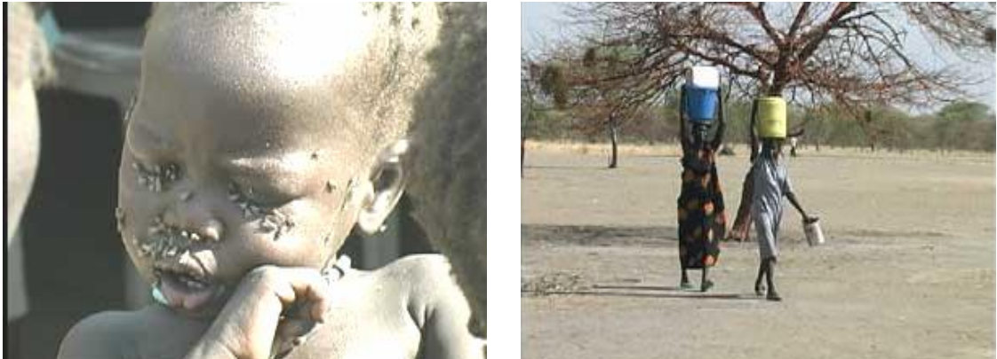
Plate 10 and 11: Sudan: factors in trachoma; abundance of flies and remoteness of water supplies 718