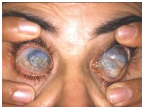
Plates 21a, 21b (left and above patient 1) and 21c (below - patient 2): Blindness from a measles epidemic in 1914 in two patients in their 70s Both patients had NLP.