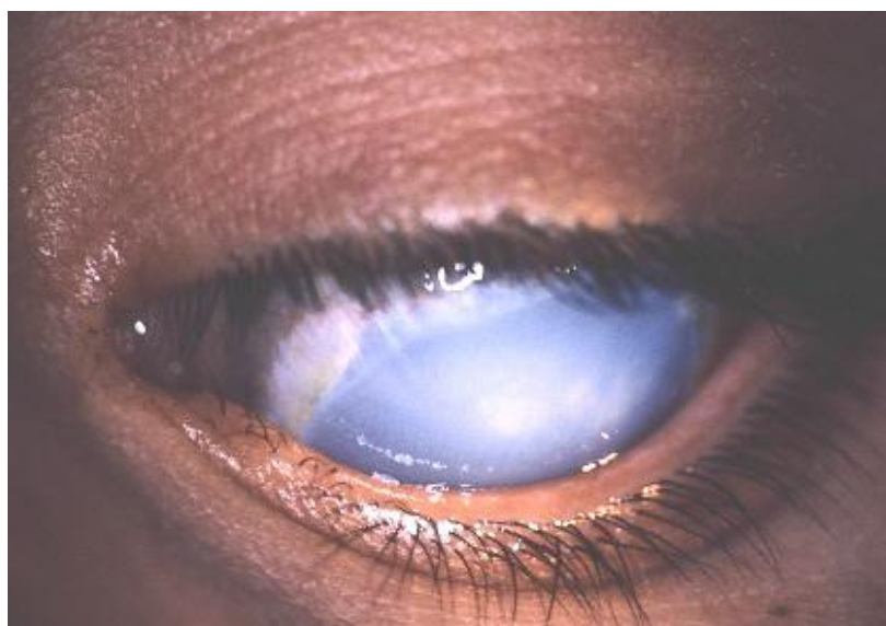
Plate 22: Measles blindness in a child