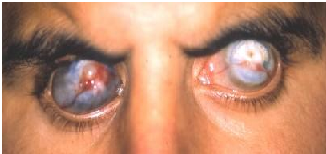
Plate 30: Grottesque looking eyes from advanced congenital glaucoma in a talented university student in the Gaza Strip