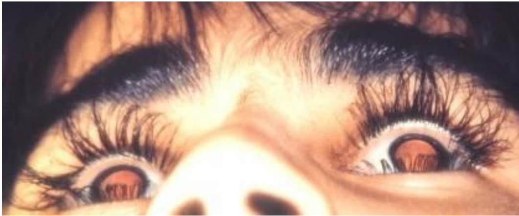
Plate 50: Trichomegaly