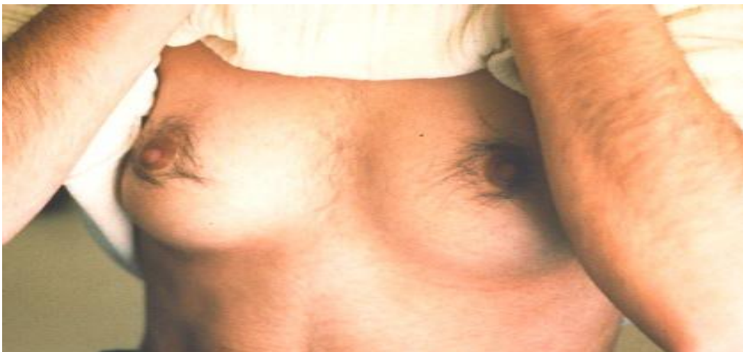
Plate 51: Generalised systemic hypertrichosis